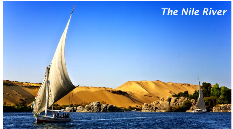
The Nile River

This morning, fly to Luxor and then transfer to the pier for embarkation on your Nile cruise ship. After lunch, visit the Temples of Karnak and Luxor. Karnak Temple is the largest built by the ancient Egyptians. See the Hypostyle Hall, the Obelisk of Queen Hatshepsut and the Festival Hall of Tuthmosis III. Continue to Luxor Temple, built by Amenophis III for Amun, his wife, Mut, and their son Khonsu. See the fine wall reliefs depicting the daily lives of the pharaohs. (B,L,D)