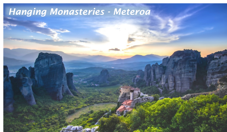
Hanging Monasteries - Meteora